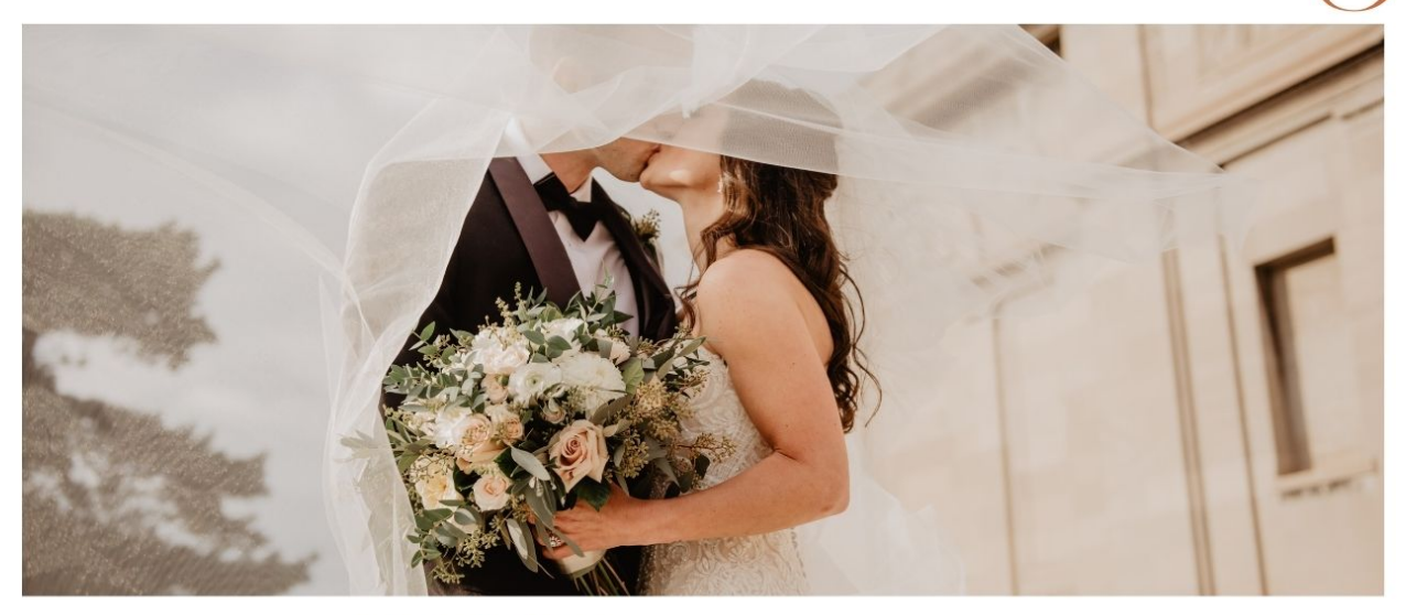
GIVE ME MORE!

Unleash your creativity and shape your own celebration with our Lux Micro Wedding Package. Craft a personalised event that revolves entirely around your own unique preferences.